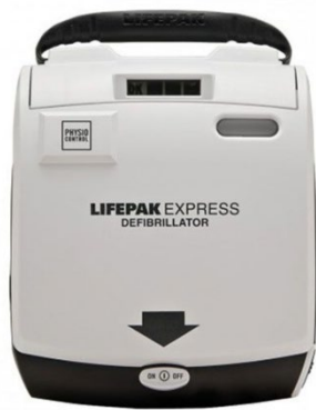
LIFEPAK EXPRESS AED